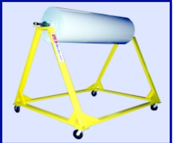
A f r a m e